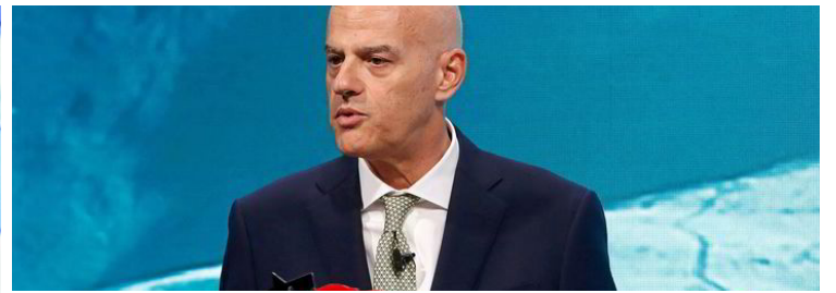
Eni secures long-term LNG supplies for Italy from giant Mideast project