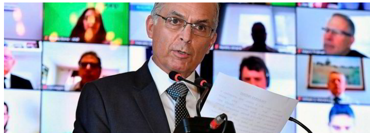
How giant hydrocarbon discoveries in Namibia are shaping latest bidding round in Brazil