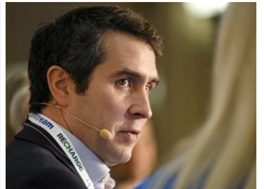
'150 Rosebanks per year' needed to keep oil output steady, says Equinor