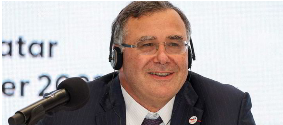
Supermajor TotalEnergies gets vital go-ahead to drill in red hot Orange basin

News TotalEnergies Namibia Venus Orange basin Africa Sub-Saharan Africa