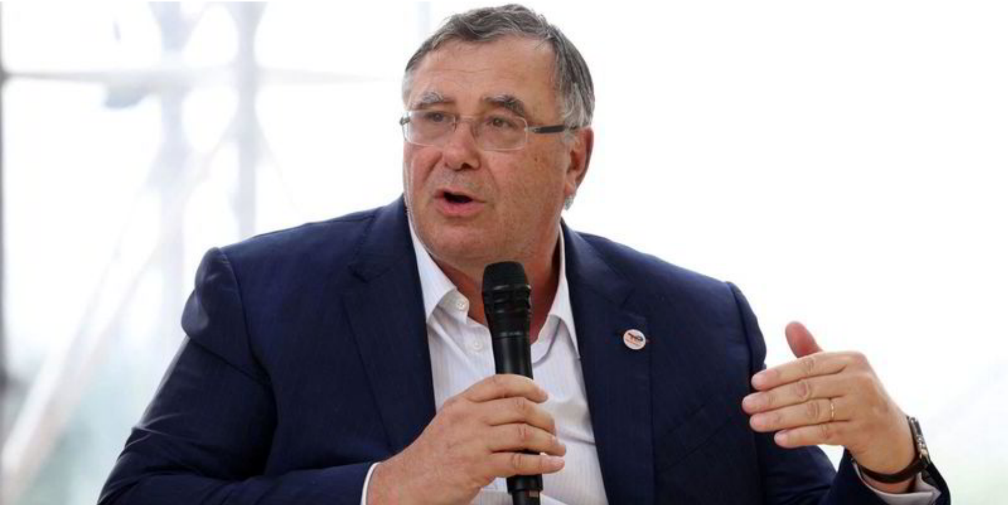
TotalEnergies chief executive Patrick Pouyanne